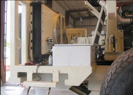
New Battery Box Install