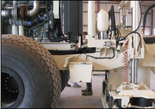
RH Battery Box Removal